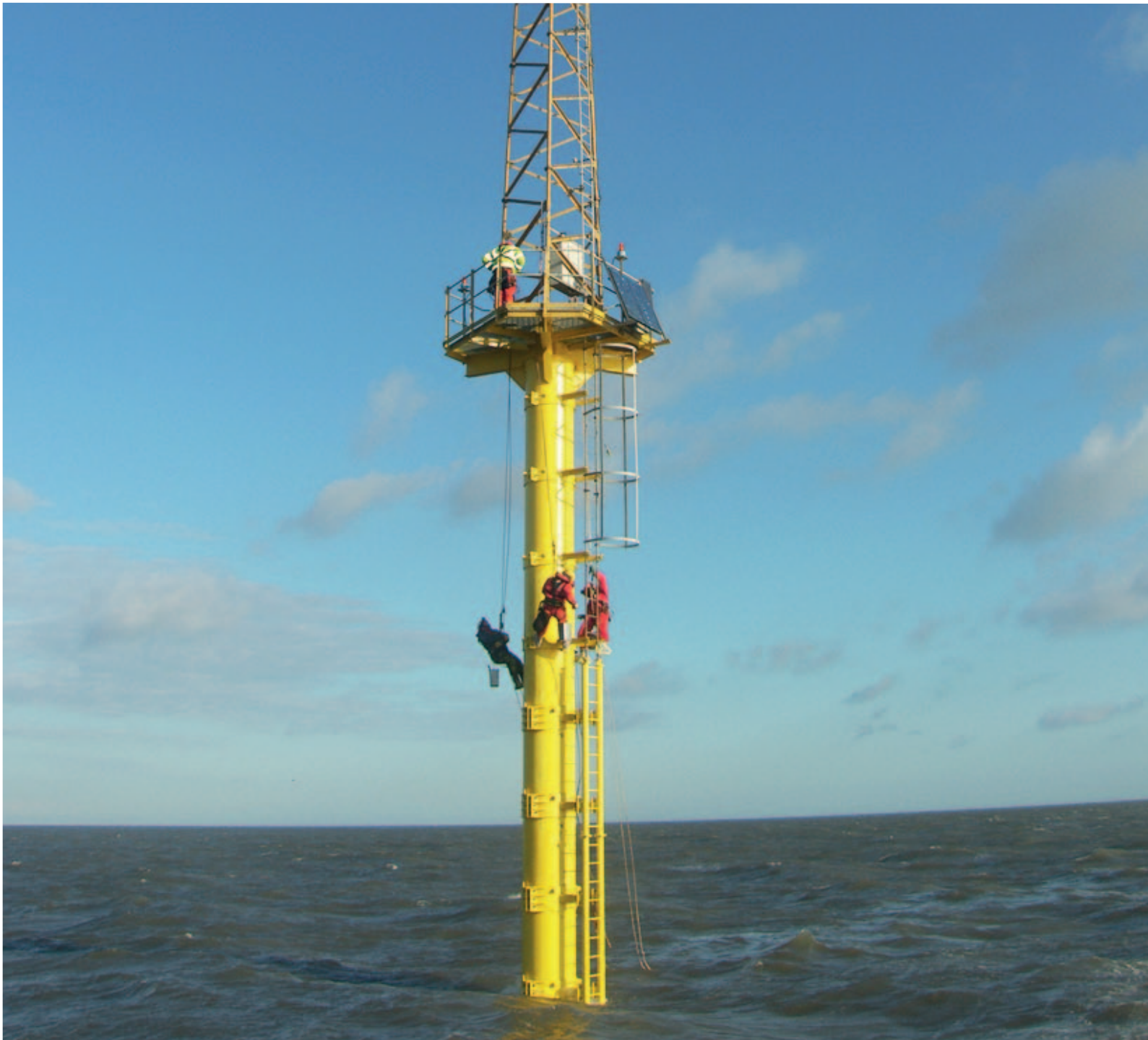
Abfad personnel performing finishing touches and final checks on Met Mast at Scroby Sands, Great Yarmouth.