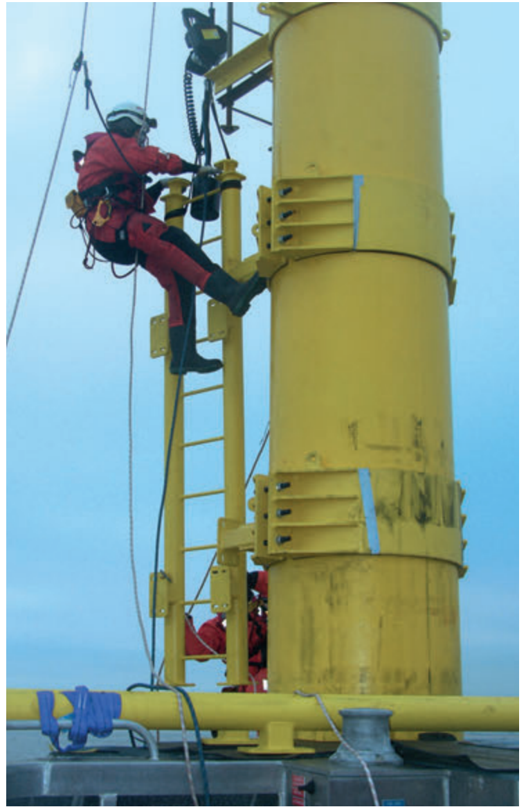
Installation of new ladder section, Abfad electric battery winch used to move and hold ladder section in place during installation.