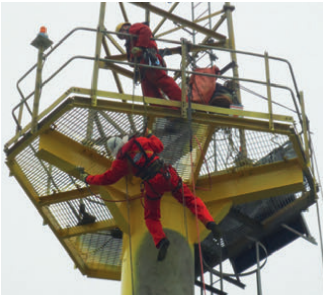
Spray coating steelwork after blasting completed.