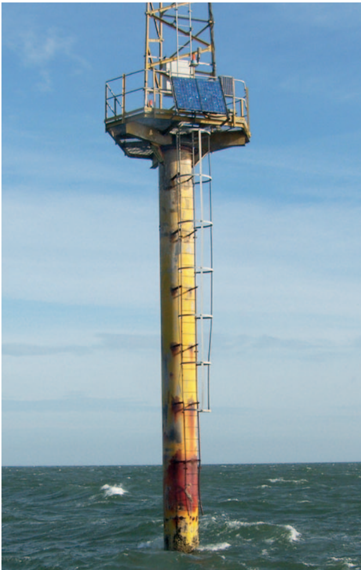
Corroded and damaged Met Mast at Scroby Sands, Great Yarmouth.