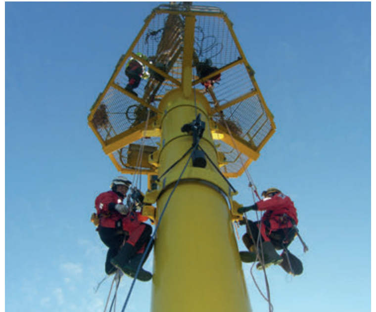
Newly fabricated Clamp sections being installed by Abfad personnel using rope access techniques.