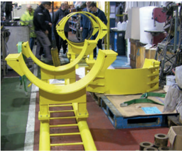
New ladder sections and clamps were fabricated, to be installed once blasting and coating work completed.