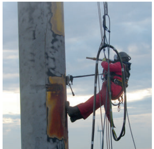
Blast operations to Met Mast stem using rope access techniques and Abfad's patented magnet system used to hold the operative in position during blasting.