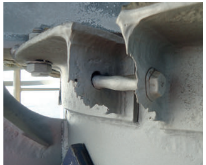
Detail of extent of corrosion to steelwork below main walkway section after blasting works completed.

Project was to fabricate new ladder sections and eight clamps, blast clean the structure to SA2.5 and apply a protective coating, remove existing damaged ladder sections, install new clamps, tighten using Hydratight hydraulic equipment, then install new ladders to structure.