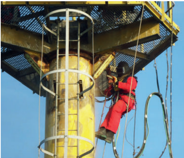
Blasting corrosion on underside of walkway and top section of Met Mast structure using rope access techniques.